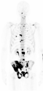
Bone scan of 52yo male with PSA of 11.6 ug/L (never had PSA testing before)

A PSA test at age 40 would have warned of a high risk needing regular PSA testing. ( "PSA at age 40 is the most powerful detector of later prostate cancer"- Prof. W Catalona )