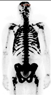
Bone scan of 60yo male with PSA of 5000 ug/L (never had PSA testing before)